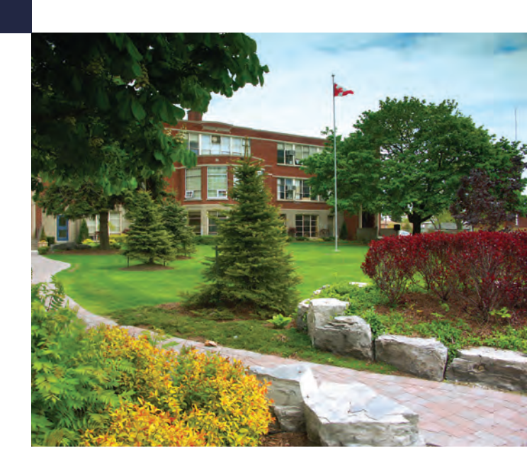
Cambridge International School in Toronto, Ontario, Canada