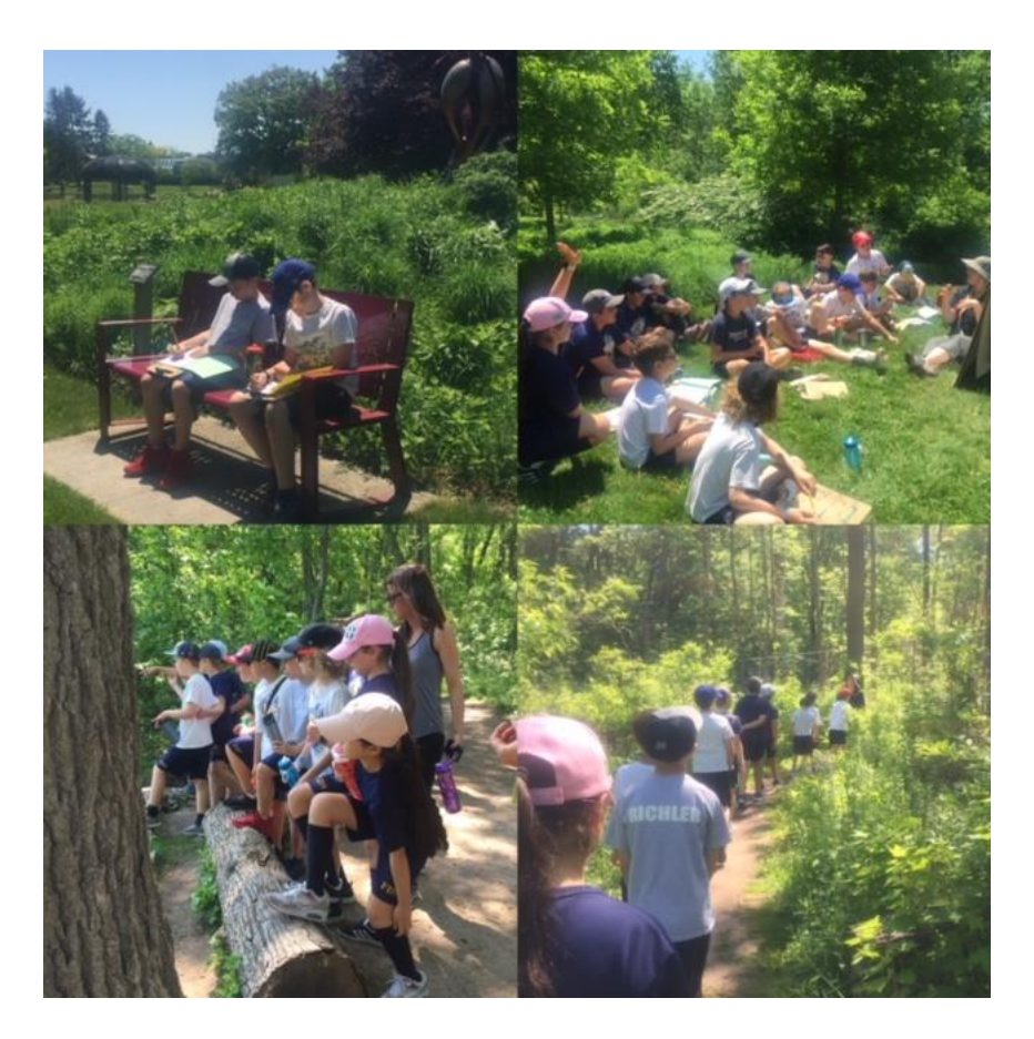
A few more pictures of our beautiful day at RBG.