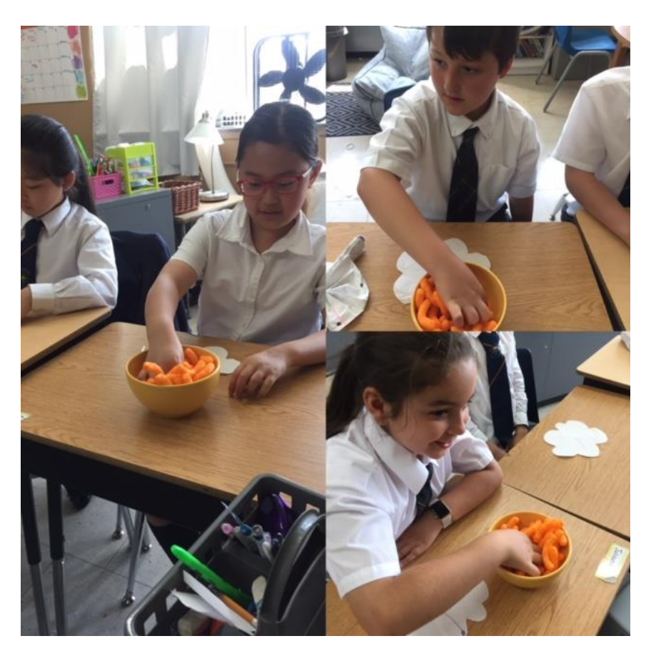
Seeing first-hand how pollen sticks to pollinators and gets carried to other flowers.